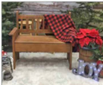
Approximate Poinsettias Sizes 6.5" pot: 14 - 16" tall and 13 - 16" wide