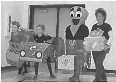
Groundhog 500 Cardboard car race winners circle: Heat 1 – Flaming V’s, Heat 2 – Wolfpack, Heat 3 – Blue Runners.